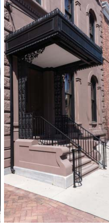
AFTER —The Market Street elevation included the replacement of 138 pieces of brownstone in 38 different profiles, shapes, and sizes.